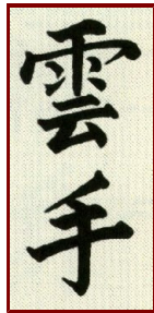
Cloud Hands - Yun shou