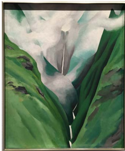
'Īao Waterfall III

Earth, this is what you want. To arise in us, invisible. Your dream, to enter us wholly nothing left outside to see. 12