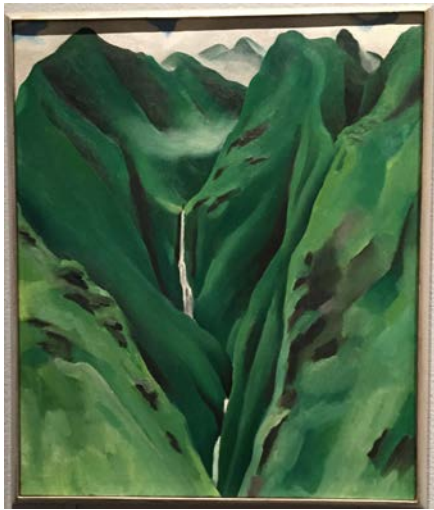
'Āao Waterfall 1

The First Shade of Engagement: Georgia O'Keeffe's 'Āao Waterfall 1 and End of Road served as vehicles for her first shade of engagement with landscape. The physical body of the visible landscape presented as a descriptive assemblage and geometry of topography, geology, hydrology, soils, flora and fauna. It regards the relationship between earth and sky; form and space: shape of valley, tributary gorges, magma outcrops, rock talus, crevasse and waterfall with clouds, wind and rain – nature's arising, abiding and dissolving. Considered most 'realistic', to Georgia O'Keeffe, the first shade is the least real, the least 'Georgia O'Keeffe'.