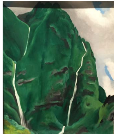
End of Road

The Second Shade of Engagement: 'Āao Waterfall 2 is used to explore audible stories, tales of genealogy and history, and myths and metaphor accorded to the landscape of 'Āao Valley . The speech of landscape, stories are bedded with the rock, immediately familiar and apparent to those who know them. More real than the first shade, Georgia O'Keeffe cultivates a deeper intimacy with landscape and its operations of nature. Subtleties of spirit, space, wind and movement abide within each stroke of paint.