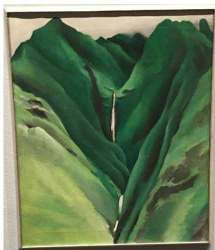
'Āao Waterfall 2

The Second Shade of Engagement: 'Āao Waterfall 2 is used to explore audible stories, tales of genealogy and history, and myths and metaphor accorded to the landscape of 'Āao Valley . The speech of landscape, stories are bedded with the rock, immediately familiar and apparent to those who know them. More real than the first shade, Georgia O'Keeffe cultivates a deeper intimacy with landscape and its operations of nature. Subtleties of spirit, space, wind and movement abide within each stroke of paint.