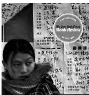
FACTORY GIRLS / Leslie T. Chang From Village to City in a Changing China

have provided Chinese families a stepping stone to a better life. The book Factory Girls: From Village to City in a Changing China by journalist Leslie Chang is full of stories that belie the students' assumption: